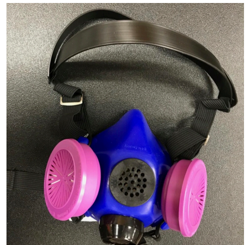
Honeywell MC/P100 Re-usable Multi-Purpose Respirator, NIOSH approved

We will continue to secure and protect our members!