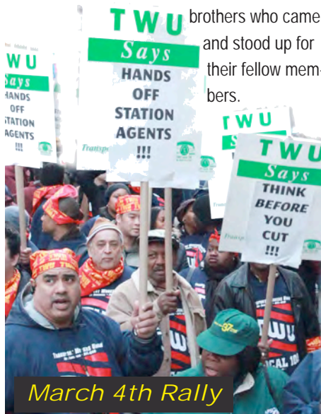
March 4th Rally

brothers who came and stood up for their fellow members.