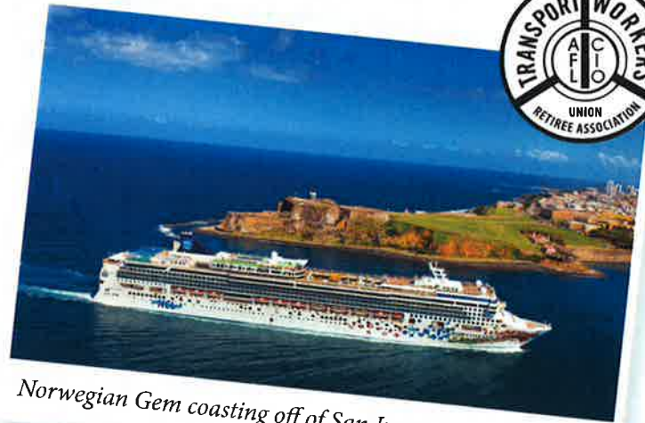
Norwegian Gem coasting off of San Juan, PR