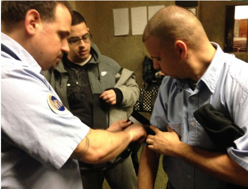
Fellow bus operators don black armbands in mourning.