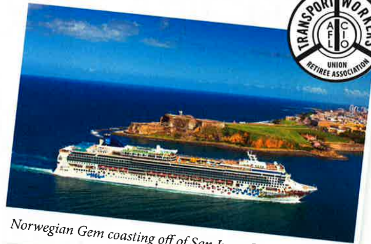
Norwegian Gem coasting off of San Juan, PR