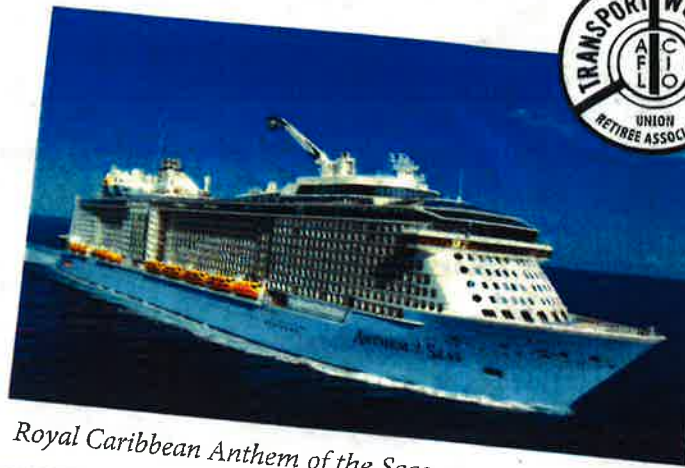
Royal Caribbean Anthem of the Seas