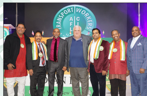
TWU Local 100 at the 2022 Indian Day Celebration held on Nov 18th

We have been bringing to management your complaints about facilities that are in unacceptably poor condition. Management has now agreed to a joint union-management inspection initiative. Defects will be identified, and we will press management to make repairs.